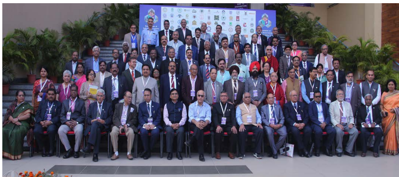
93 rd Annual General Meet and National Seminar on Autonomy for Excellence in Higher Education organized by Association of Indian Universities on 16 th – 18 th February 2019